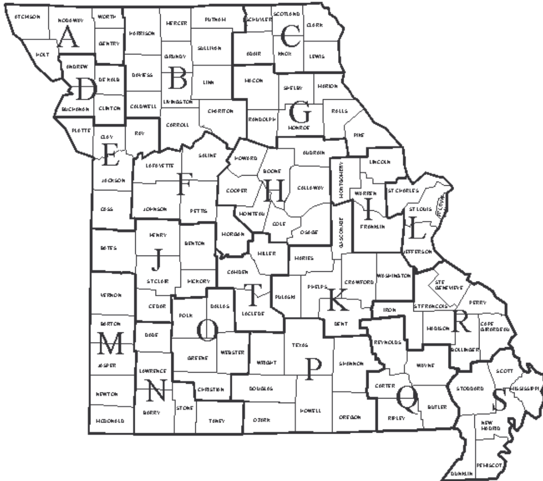
Map of the 20 Solid Waste Management Districts